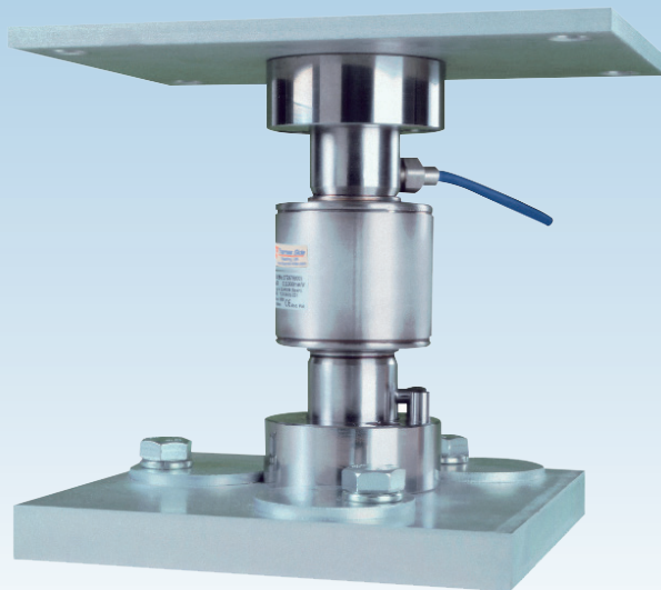
Upper and lower attachment plates to be supplied by customer Protective gaiter is removed for clarity

This stainless steel self-centering rocker column load cell is fully welded and hermetically sealed, with protection to IP68 and IP69K. It's an ideal solution for weighbridges (truck scales) thanks to its approval to OIML C4 (4000 divisions) and integral lightning surge arrestors. As well as being extremely tough, the cable's halogen-free Polyurethane sheath has high resistance to rats, chemical attack, cuts, ultraviolet light and temperature changes.