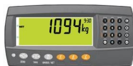
R420-K401-A R42x Indicator VDC