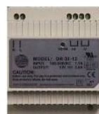
A10010 Power Supply, 12VDC, 2A DIN Rail

*Note1 Either R420s ABS or R423s flush stainless steel housing could be used.